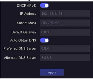
Figure 3-3 Network Settings

Step 3 Click Apply to save the settings.