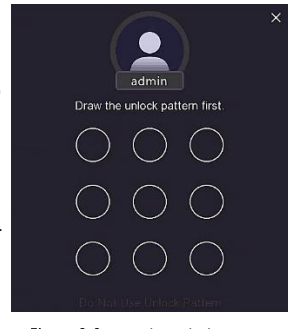
Figure 3-2 Draw the Unlock Pattern